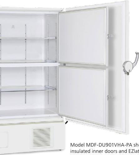
Model MDF-DU901VHA-PA showing insulated inner doors and EZlatch access.